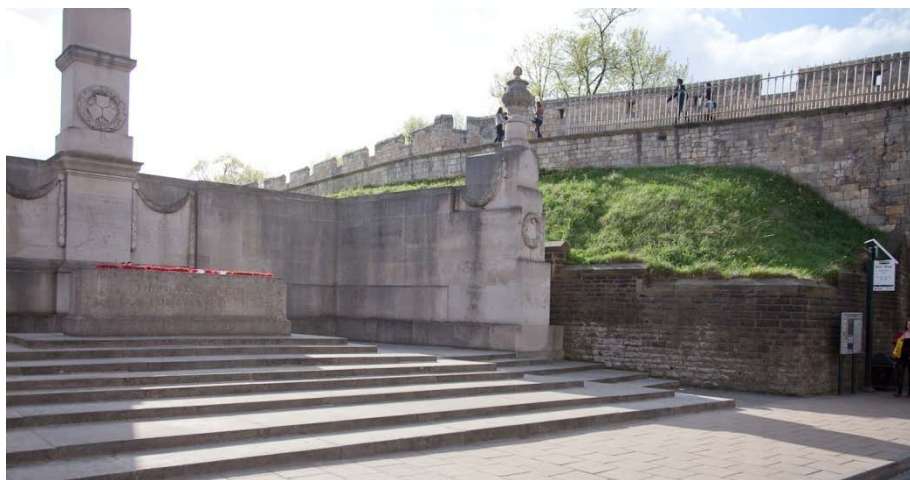
York Railway War Memorial