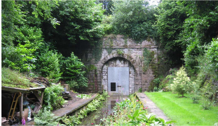
Talyllyn Tunnel portal