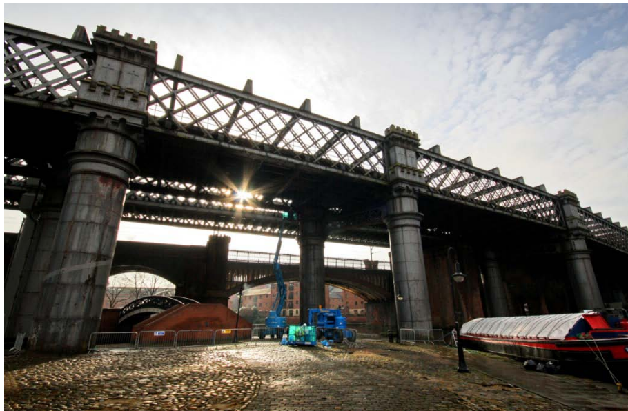
Castlefield Viaduct. Manchester